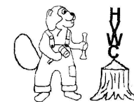
"CHIPS" the club logo.