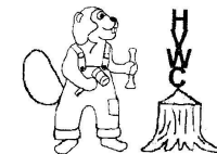
"CHIPS" the club logo.